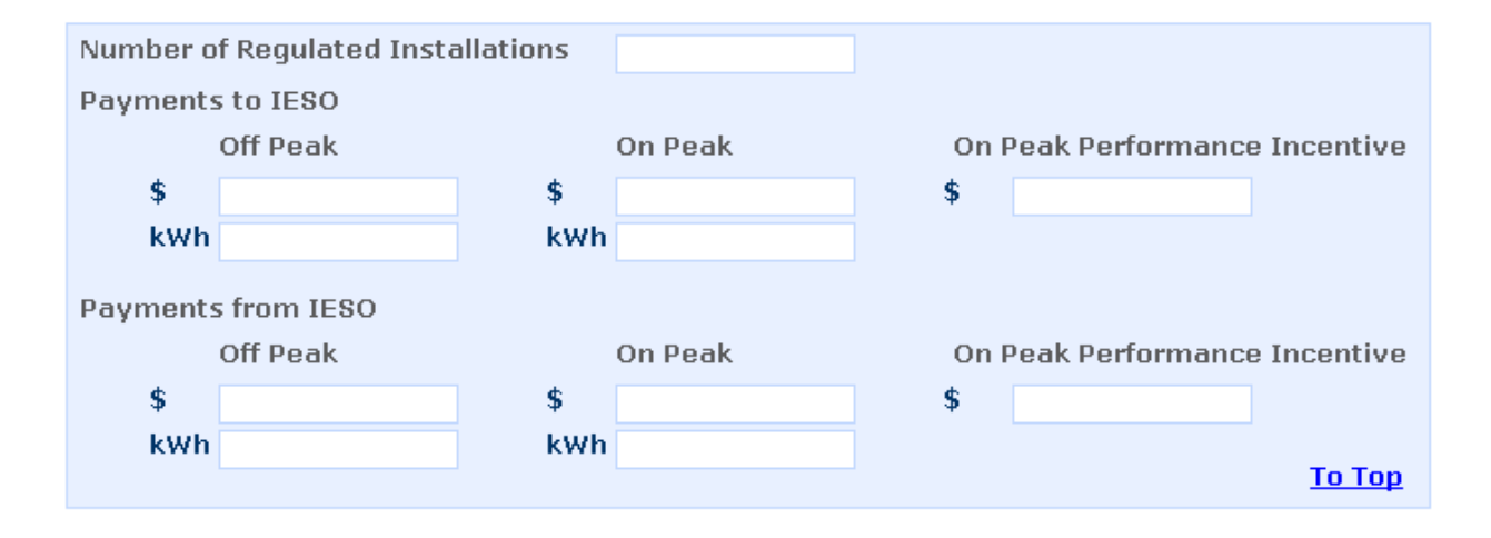
Figure 2: Claims for the RESOP

Figure 2 below shows the claim form excerpt that distributors must complete to settle the difference between the contract payments made to the EGs regarding RESOP and the wholesale market cost of energy.