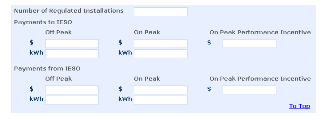
Figure 2: Claims for the RESOP

The amounts paid to EGs at the contract price should be recorded in Account 4705, Power Purchased. The settlement amount under CT 1410 is also to be recorded in Account 4705, Power Purchased.